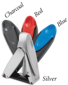
If no stamp color is specified, you will receive Charcoal.

Maintaining a record book is not required by Nebraska law, but it is recommended by the Secretary of State.